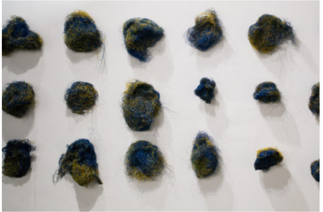
Lois Anguria, From Uncle – Unwrapped for Easter (detail), 2013-14